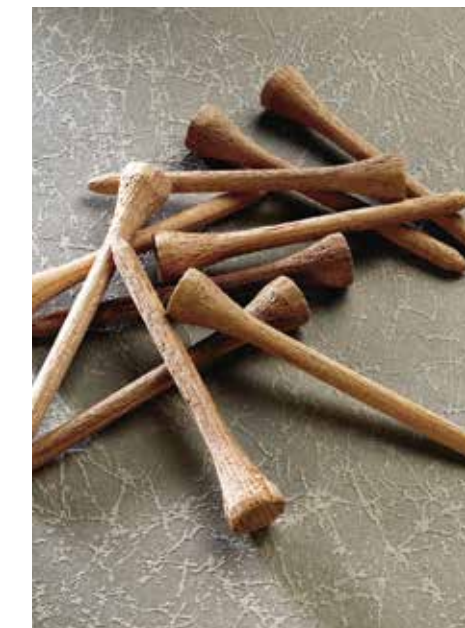
Fallen redwood trees have been reclaimed to create a distinctive start for every member's first round.