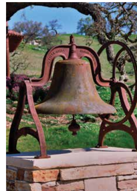
This historic bell, once used to summon firefighters on the ranch, now serves as the clarion for players making a hole-in-one at The Preserve.

The Preserve Golf Club staffs a talented team of golf professionals who serve and support our member players. They provide attentive and personal service to every member and guest. From offering advice on enhancing a player's swing to tips on the approach of a particular green, you will find the staff knowledgeable and accessible to serve your needs.